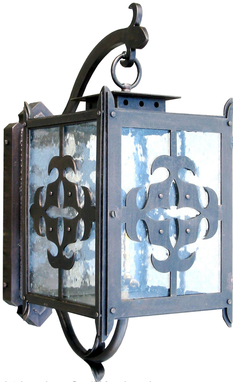
#230-mb1-br-w-ba ~ Quail Meadows Lantern iron lantern shown with seeded glass Blackened rustic Finish 8" wide ~ Custom Sizes & Materials Available

Agoura Hills Newport Beach Dealers Nationwide US & Canada 818. 597. 9494 t EcoCA@adgmail.com www.ArchitecturalDetailGroup.com www.GreenHotelLighting.com www.adgLighting.com