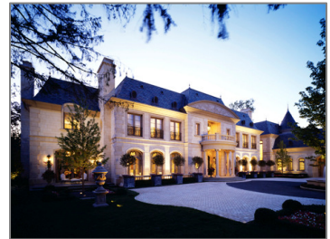
Le Grande Reve

# 472 Cb6 Ir Ba ~ French Lantern Iron forged lantern with textured silver leaf Cast brass ornament ~ wax candles ~ mixed media shown with clear glass