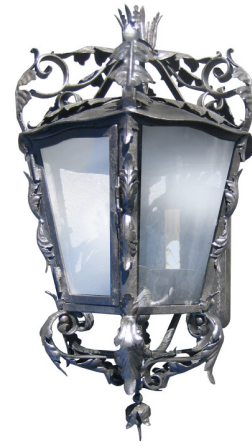
Complimentary lantern & sconce